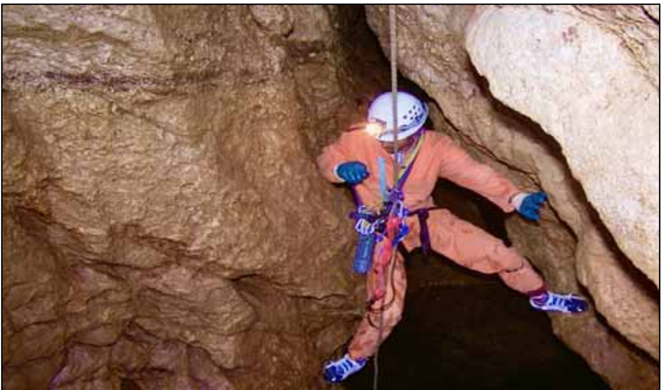
Photo 1: Single Rope Technique in use in unknown cave.