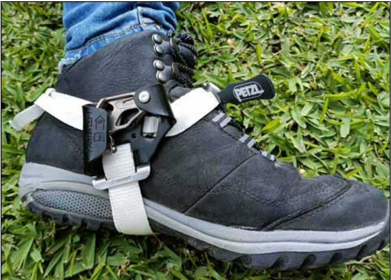
Photo 3: The Petzl Pantin Foot Ascender attached to a boot.

As always, come to a training day and try before you buy. It is a great piece of kit that can really make ascending much easier and enjoyable.